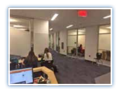
Hallway & Counselor Offices