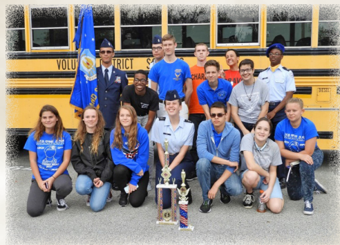
Regulation Drill Team Cadets at Timber Creek Drill Meet.