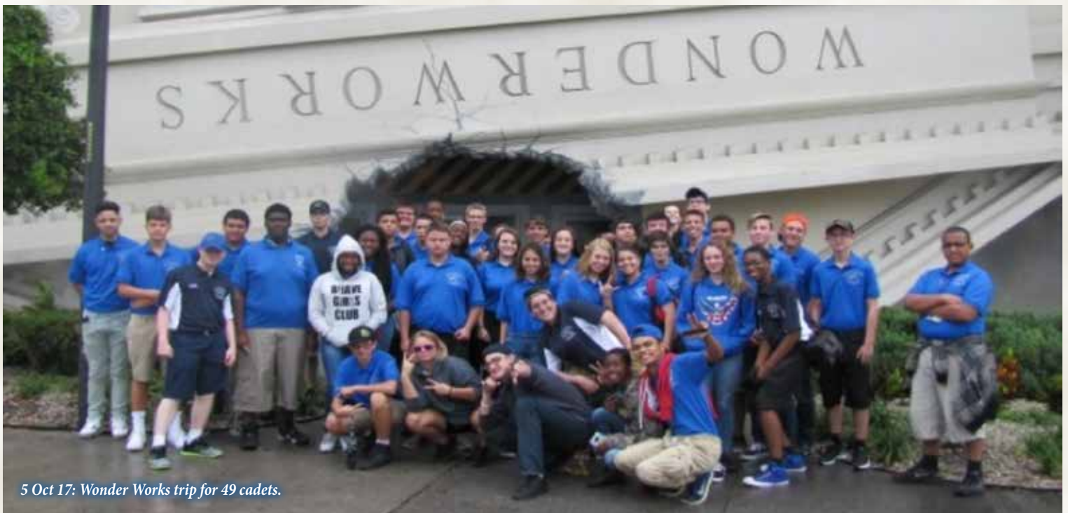
5 Oct 17: Wonder Works trip for 49 cadets.

The Performing Arts Division of the Academy of Unified Arts is teaming up with the ACH Culinary Division to present Murder at Café Noir, an interactive Murder Mystery Dinner Theatre Experience. Guests will sit down to enjoy a gourmet meal while the murder unfolds around them, putting the guests in the middle of the action, and even center stage, at times. The shows will be Friday, December 1st for a dinner show and Saturday December 2nd for a brunch, lunch and dinner show.