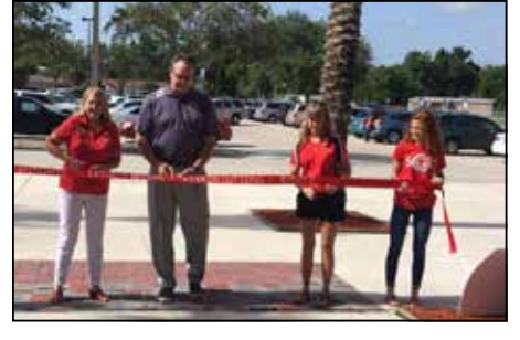
Ribbon Cutting Ceremony at Open House.