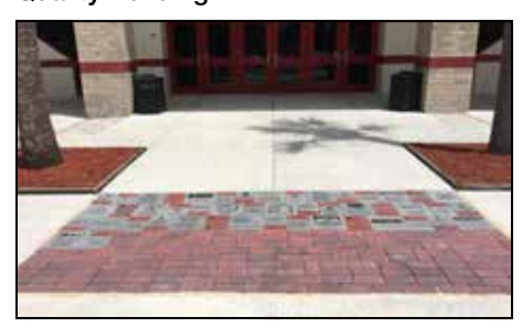
The first installation of the bricks at the auditorium is complete. Come check it out!