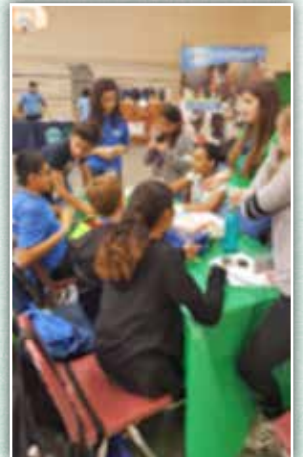
22nd Century Mission Challenge