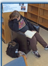
Students enjoy a day of silent reading during lunch periods