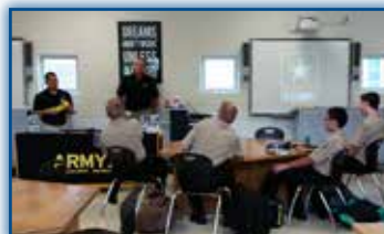
WHS ROTC students speak with U.S. Army reps