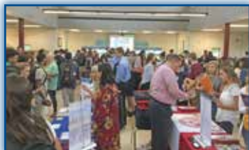
WHS students visit 24 college representatives