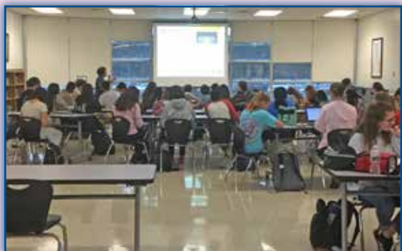
WHS Students learn important resume writing techniques