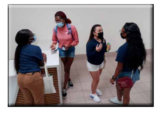
Eagles Visit FIU Florida International University