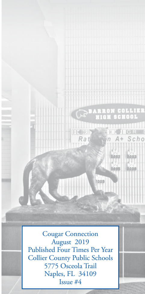
Cougar Connection August 2019 Published Four Times Per Year Collier County Public Schools 5775 Osceola Trail Naples, FL 34109 Issue #4