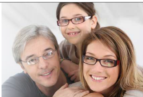
Meet your doctor