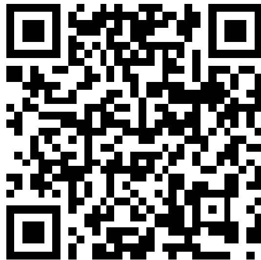
Backpack PayPal Link