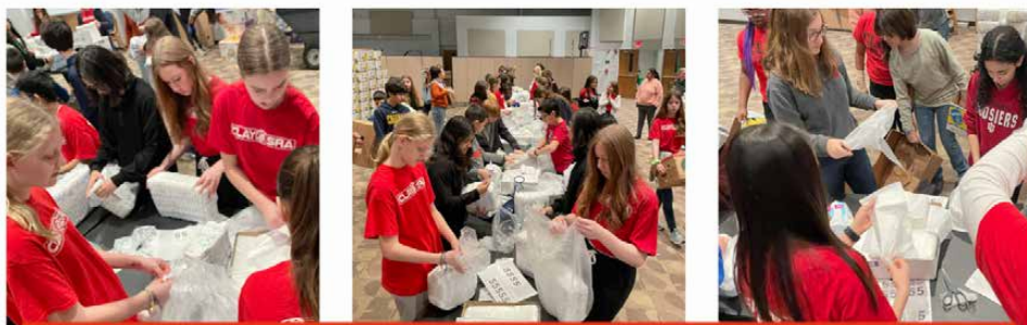
SRA Field Trip to Grace Care Center 2023

The Clay Student Representative Assembly (SRA) went on a field trip to the Grace Care Center this March. The trip served as the perfect opportunity for students to see how their efforts from their successful canned food drive in the fall are directly impacting families in Hamilton County. While at the center, SRA students took a tour, listened to a presentation about donation and volunteer needs, and participated in a food sorting activity. SRA is comprised of 125 students in grades 6-8. The club is application based and meets monthly throughout the school year. We are proud of our young leaders!