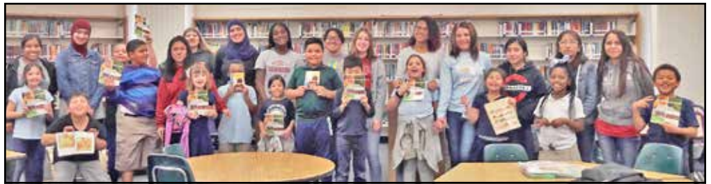
January 10, 2020 Teen Trendsetters at Skycrest Elementary. Every child takes home a book and parent guide each week.