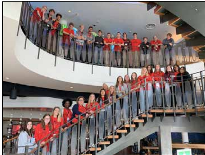
CAICC Juniors at Universal Studios, November 2019

CAICC Sophomores in Ybor City November 2019