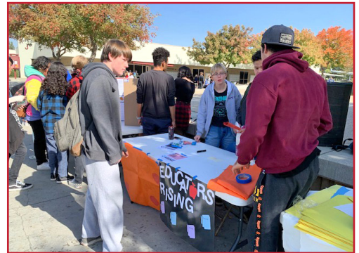
Educators Rising Fall station event at lunch