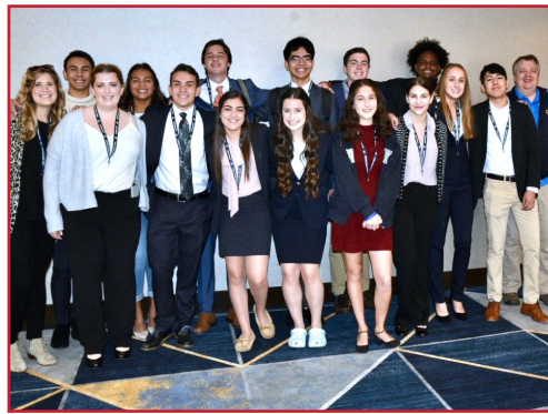
Team at the Empire Tournament in San Francisco