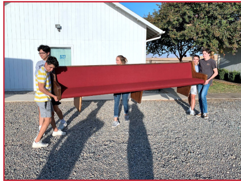
Team Collecting pews for the new courtroom on campus