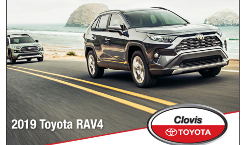
2019 Toyota RAV4

Toyota of Clovis Proudly Supports Clovis West High School Golden Eagles!