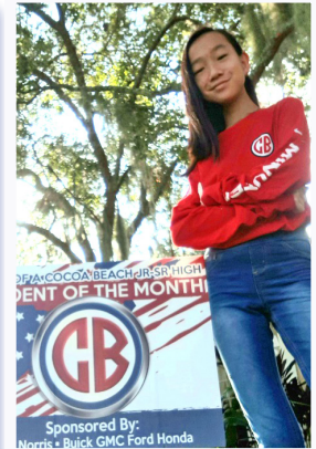
River Saint Gabriel