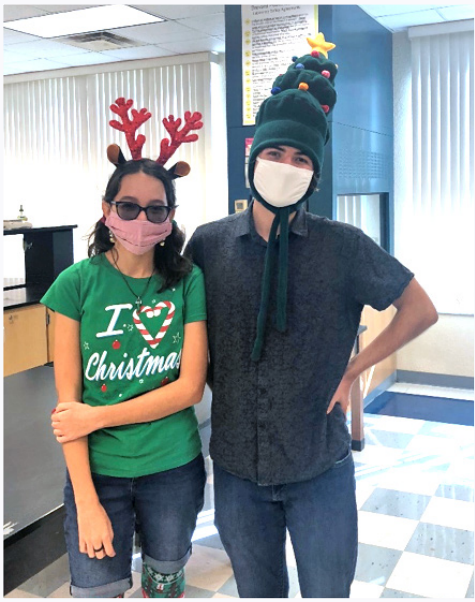
Students showing off their festive spirits