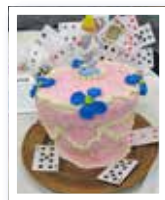
Best Character/Object/figure: #1 Alice in Wonderland