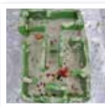
Best Scene/Setting - #4 The Shining