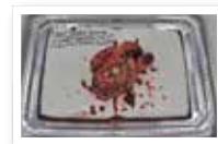
Best Overall - #1 The Tell-tale Heart