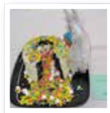
Most Creative - #6 Esperanza Rising