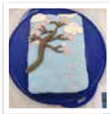
Best Cover: #16 The Housekeeper and the Professor