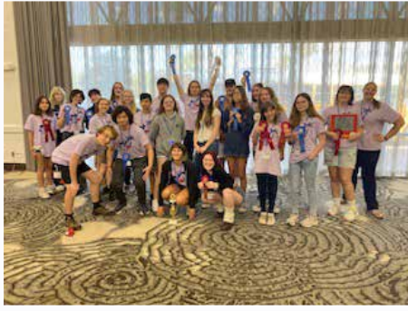
Pictured with awards: