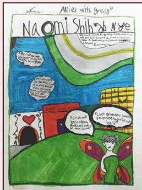
8th Grade Student Work