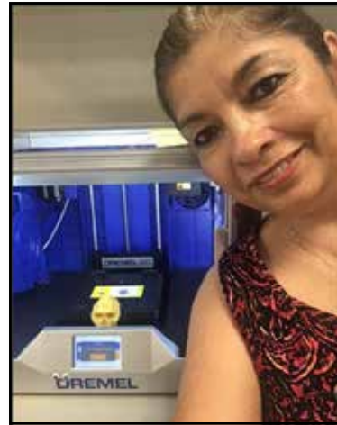
The 3-D printer in this pictured with a 3-D printed skull.

Below is a group of teachers using the 3-D manipulatives to work on hands-on science labs. 7th grade science teachers will be doing this lab with our students.