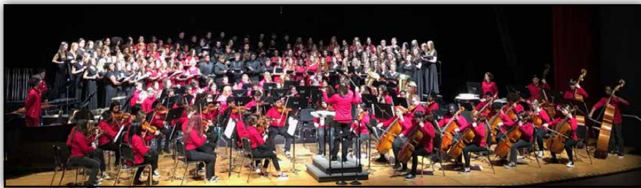
Fairfield Pops and Holiday Chorus

2022 is off to a great start in the Fairfield High School Orchestra Department. Right now students are BUSY preparing for the OMEA Solo & Ensemble Adjudicated Event and the Large Group State Contest. Each Thursday string players from both the Philharmonic and Symphony Orchestra meet to rehearse with the Fairfield Pops and very soon the pit orchestra for the musical will be begin.