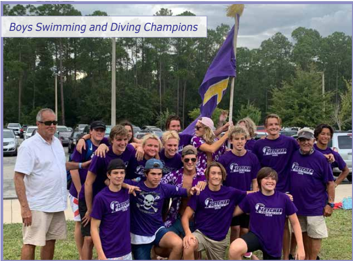
Boys Swimming and Diving Champions