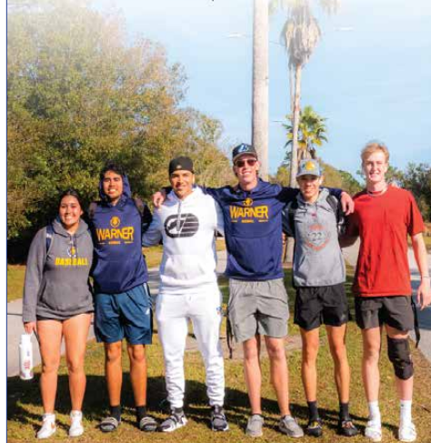
Central Florida's Christian University