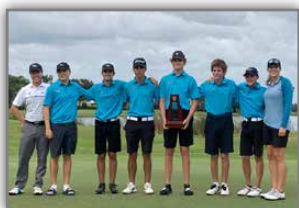
2nd place Regional finish