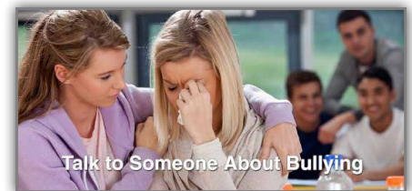
Talk to Someone About Bullying