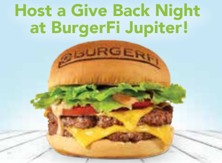
Located at Harbourside Place Sign Up at BurgerFi.com/SFLGiveBacks