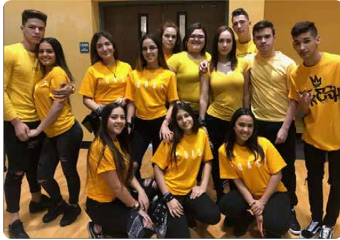
ICHS' science team had a wonderful hands-on booth as families turned copper pennies into silver or gold! Go Gators 🐊 #stemtastic2019