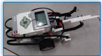
See above for the team picture and a picture of the robot.