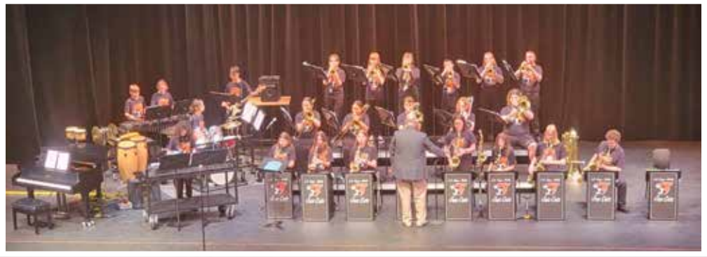
Jazz Band at MPA at Venice HS