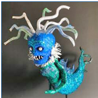
Sirena by Sofia Figueroa