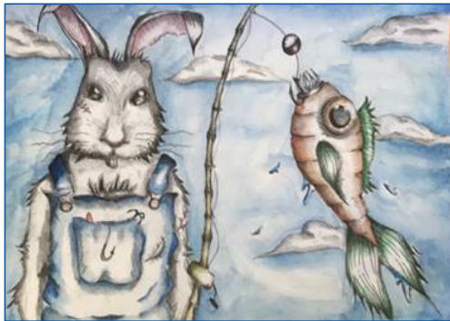
Tuesday Fishin by Bean Coughlin