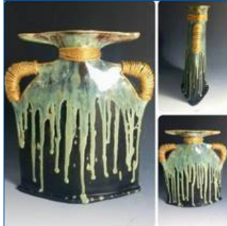
Antiquity Restrained by Izabella Long