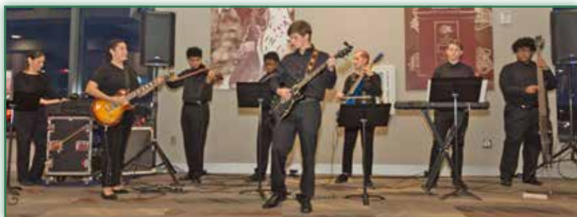
*Picture from performance for the FL Supreme Court Justices Gala