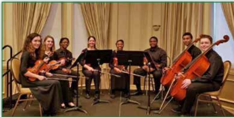
*Picture from performance for the FL Supreme Court Justices Gala