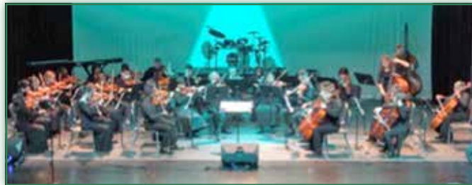
Lincoln High Orchestra