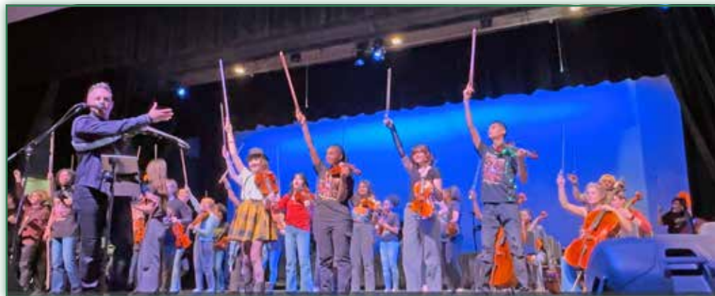
Electrify Your Symphony with Haydn Vitera (January 2023)