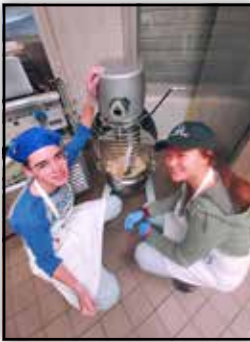
In October, students enjoyed participating in the annual Cake Wars Contest.