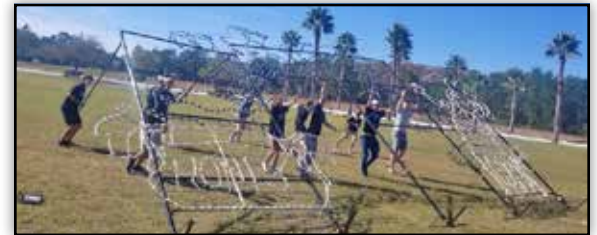
Helping with holiday lights!