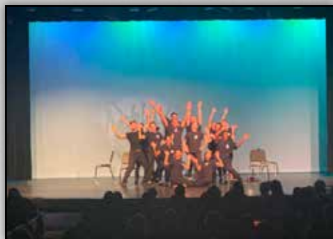
A packed house enjoyed the November Thespian Showcase