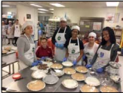
Last month, MHS Culinary Pirates were taught how to prepare a turkey. This was just the beginning of a delicious Thanksgiving feast, which included mashed potatoes (50 pounds worth!), dressing, gravy, macaroni and cheese, green beans, and an assortment of tantalizing pies.