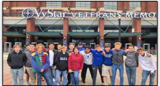
Sports Marketing students enjoyed seeing the Jacksonville Iceman School Day Game.