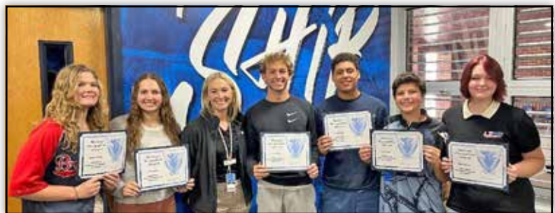
Congratulations to students earning a College Board Recognition Award!