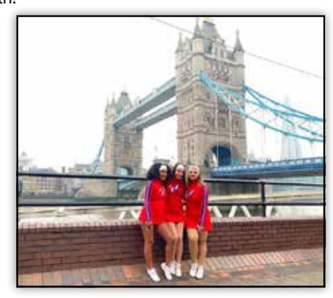
All Americans in London, England