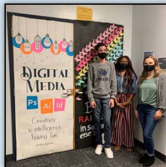
Pirate Design - Most Industry Recognizable Door