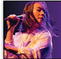
Refraction by Amira Rooney