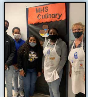
Culinary - Most Original Door