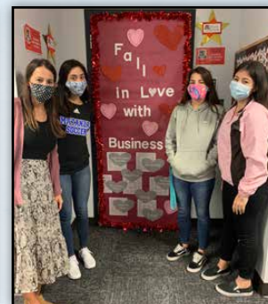
Marketing - Most Creative Door