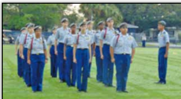
JROTC DRILL TEAM

fact, this year, all JROTC competitive teams qualified to advance to the state finals in their respective sports. The MHS JROTC program enjoyed a tremendous amount of success during this past school year.