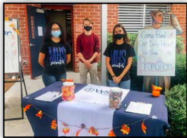
VyStar Interns educate peers on financial literacy topics