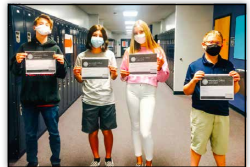
MHS's newest MOS Word Specialists!