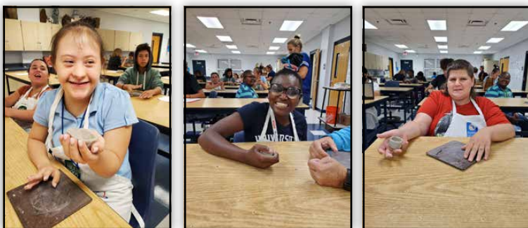
Students in the art room are having fun while learning Geometry!