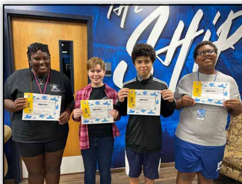
From L to R: