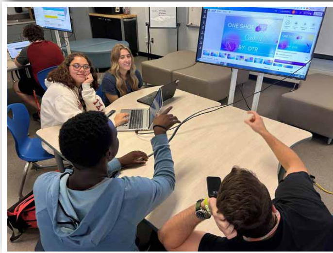
INCubatoredu students prepare for product pitch events.

On the day of the district event, the other six MDHS teams will compete with the runner ups from three other schools (East Ridge, Tavares & Eustis) to attempt to earn a wildcard competition slot.