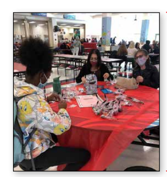
Members creating birthday bags for students with birthdays in the first semester.