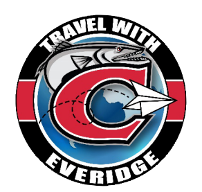
Travel the World!