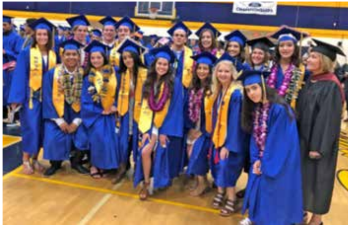
Health Science Academy 2018 Graduates