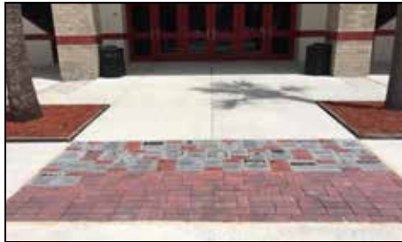
The first installation of the bricks at the auditorium is complete. Come check it out!