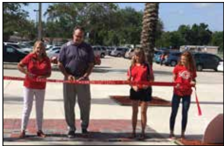
Ribbon Cutting Ceremony at Open House.