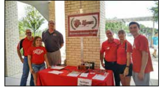
Open House Membership Drive! SGA helps lead the way!

many opportunities small and large. Spend an hour manning our membership tables at various sporting and arts events. Plan a monthly staff appreciation morning. Solicit sponsors for our upcoming Poker Tournament on October 14th. Help the writing effort from home by working on marketing materials, grants, newsletter articles or website content. If you're ready for a larger commitment, our treasurer is seeking a replacement. There are many other opportunities to get involved. Please contact us at redknightfoundation@gmail.com to let us know your interest and we will find something to fit your desired level of commitment!