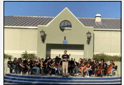
School District of Indian River County