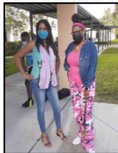
Celebrating Breast Cancer Awareness