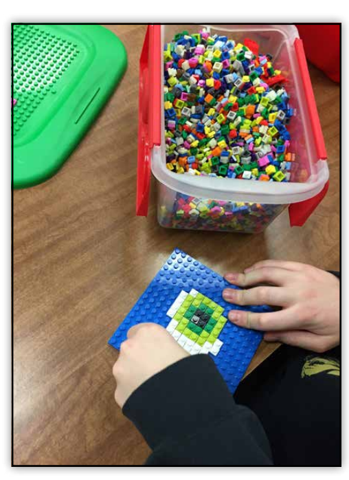
Examples of different activities that students have created during Maker Space time in the PJHS Library,