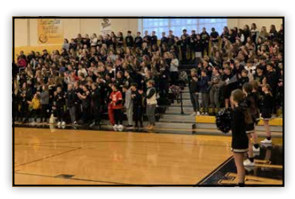
The PJHS Student Section was rocking for the home boys basketball game on January 16.