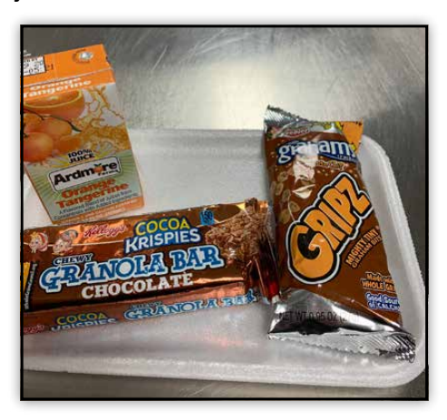
Examples of Grab and Go Breakfast options in the PJHS Cafeteria.