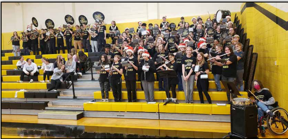
The PJHS Pep Band performs at a junior high basketball game prior to the Holiday Break

Be on the lookout for more information about this year's PJHS Bands Recital Day happening on Thursday, March 17 at 7:00 p.m. Students will perform a variety of solos, duets, trios and quartets while collaborating with a professional piano accompanist.