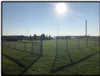
Before (Summer 2021)

We have several goals related to this project. One of those goals includes providing seedlings back to our community at the end of a 3-4 year cycle. Fingers crossed that our prairie becomes not only an outdoor classroom but an opportunity for all of us to share in many different ways.