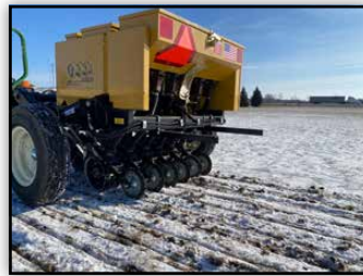
Winter Seeding (2022)