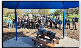
Students gather for a photo at the Band on the Run event

Thank you for all of your support of the PJHS Bands this year! You'll hear us again in August!