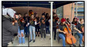
The PJHS String Ensemble plays the National Anthem at the a recent Toledo Mud Hens game

The 7th and 8th Grade Orchestra students performed their final concert of the school year at the end of April. Students performed very well! Students in the PJHS String Ensemble also performed the national anthem at the Toledo Mud Hens game at the beginning of May. Go Jackets!