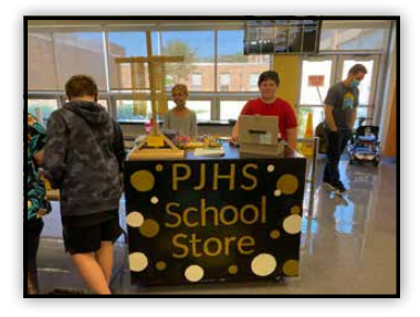
The PJHS Student Council has re-opened the school store, which is open during lunches on select Fridays