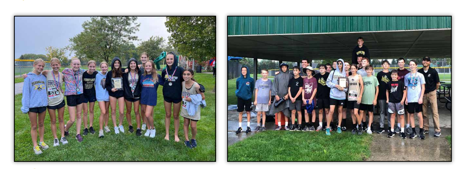
Both the boys and girls PJHS Cross Country Teams claimed NLL Championships on Monday, October 4.