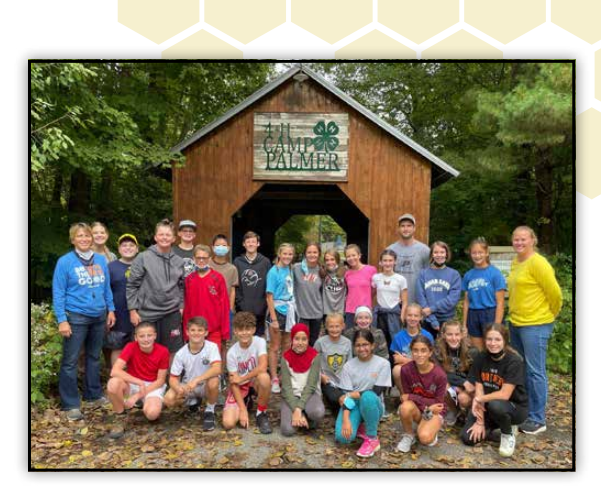
Students and staff members attend HIPP Camp at Camp Palmer from October 6 - 8.

JHPO would like you to mark your calendar for the upcoming Boo Bash Dance on Friday, October 22 from 8:00 - 9:30 p.m. The Junior High and JHPO will be sponsoring this spooktacular Halloween event! There will be music, refreshments and a special Halloween themed photo booth! Please look for a sign-up genius to come out soon as we're always looking for volunteers to join the fun! Tickets will go on sale starting October 11.