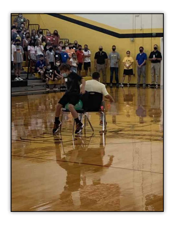
Students compete in a WEB Activity at the Welcome Assembly on the 7th grade first day of school

Be on the lookout for more WEB events as the year progresses!