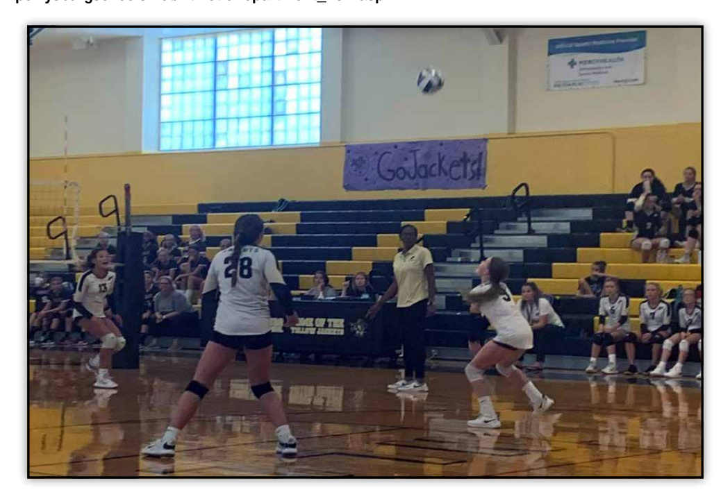
The 7th Grade Volleyball Team competes in a match earlier this season

You may find more information on the PJHS Athletic Department web page at http://www.perrysburgschools.net/AthleticDepartment PJH.aspx.